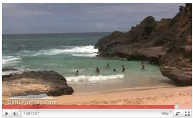
Exhibit B: Halona Cove in Hawaii

Notice the rock formation just above Deborah Kerr's head. Although it is kind of fuzzy, it is clearly a match for the rock in the upper right of the lower photo. Note the slope is steeper on the right side than the left side, and the points on the left side are visible in both. The rock shows up twice in the movie scene, proving unmistakably that the scene was shot in Hawaii, not Big Sur.